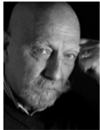
Photo assignments included: eight Olympics, Stanley Cups, World Series, Presidential trips, Vietnam in 1973, the Iran hostage crisis in 1979-80, & the imposition of martial law on the Solidarity movement in Poland in 1981. He was also in New York to cover the 9/11 terrorist attacks on the World Trade Centre in 2001.

Prior to his recent post as photo editor at HELLO! Magazine, Peter served as chief photographer at Maclean's for 17 years. He has also worked as a photographer and editor with the Canadian Press and the Associated Press in London, New York, and Washington, DC, and was the official photographer to Prime Minister Brian Mulroney in 1984-85.